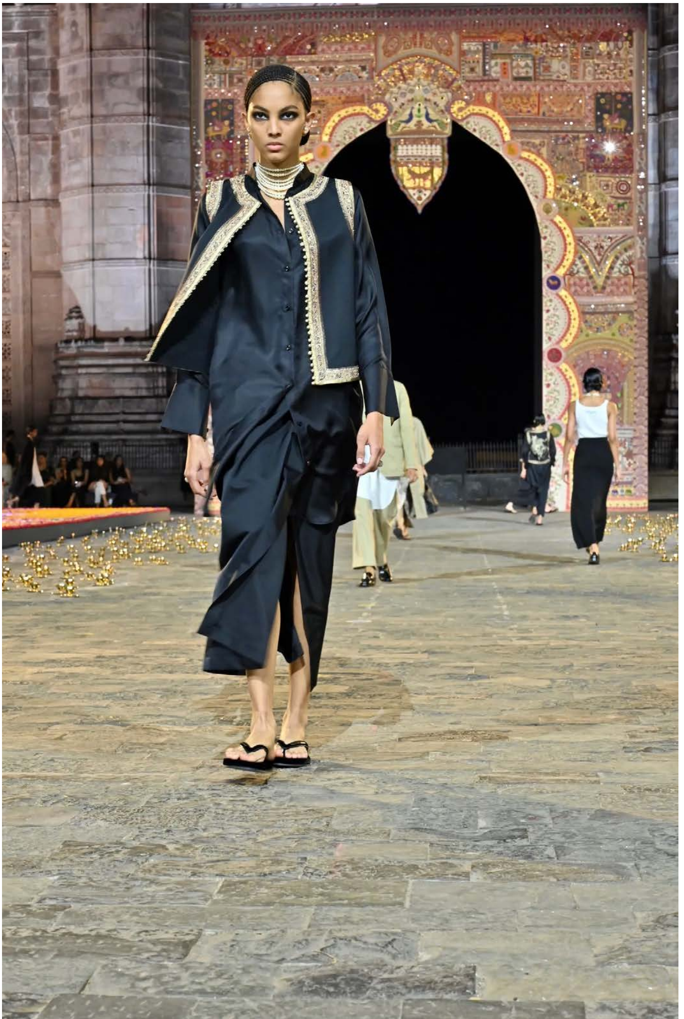
Rubina A. Khan/Getty Images